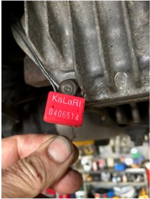
Bolts to be drilled for Diff seal