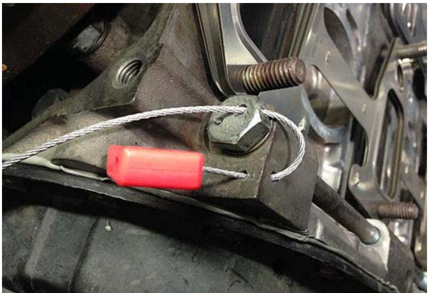
Holes to be drilled for engine seal