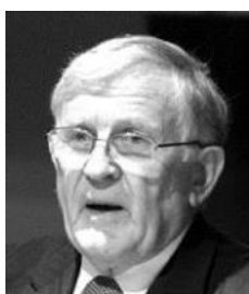
The Hon Peter Rae